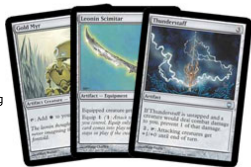
Plating is great, if you've got enough artifacts...